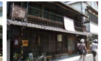
Tamadaya (Old Inn)